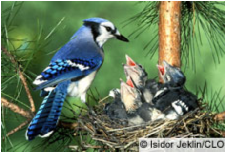
The Blue Jay chirps like a hawk, especially the Red-shouldered Hawk.