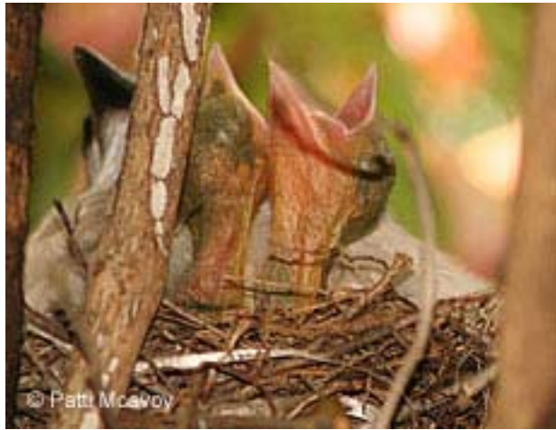
The chicks have no feathers until they are about 17-21 days old.