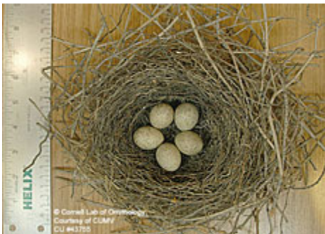
There are usually 2 – 7 eggs in the Nest and the nests are made of Grass, twigs, and sometimes mud.