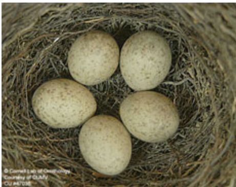
They have light brown spots with a Tanish colored shell